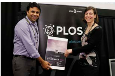
Celldance Video Premiere