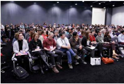
Attendees at Microsymposia