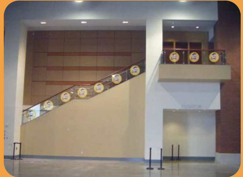
Exhibit Hall Stairs and Balcony

This opportunity provides your company with 10 decals on the staircase glass, three decals on top, as well as a carpet decal.