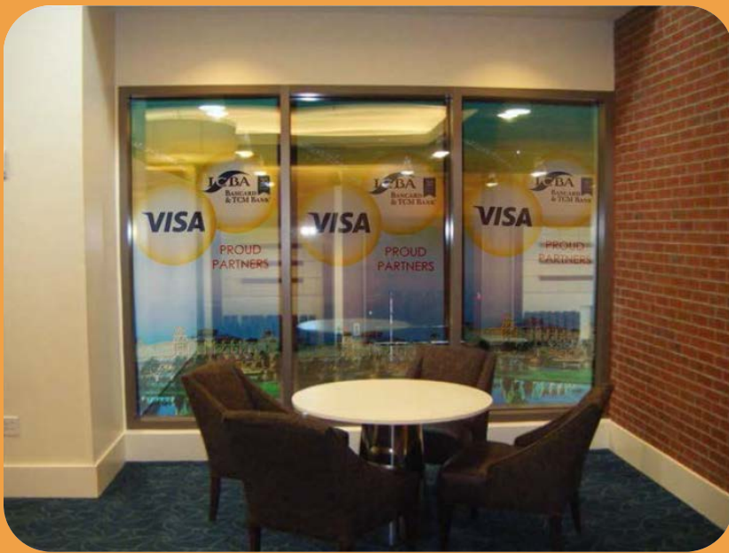
Exhibit Hall Window Cling 4 Opportunities

Window Clings will be placed in areas overlooking the Exhibit Hall. Each opportunity includes a set of (3) 38" x 80" window clings.