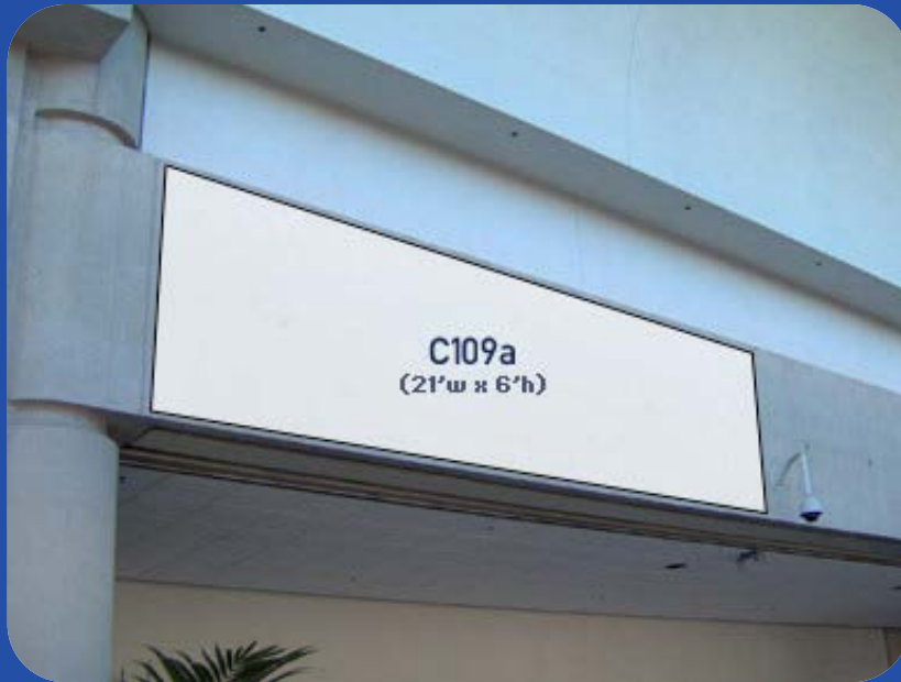
C109a (21'w x 6'h)