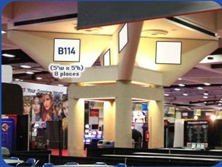
EXHIBIT HALL COLUMN CLUSTER CLINGS