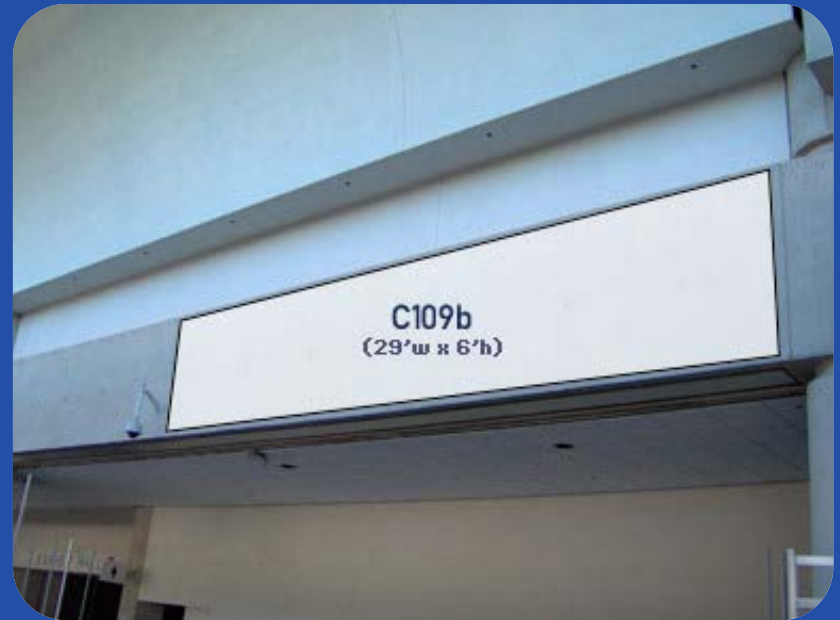
C109b (29'w x 6'h)