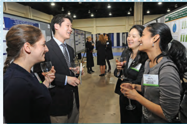
EXHIBIT HALL LUNCHES

Join us in the Exhibit Hall for hors d'oeuvres, refreshments and networking as you visit the Posters and Exhibits. View state-of-the-art equipment and techniques. This complimentary event is open to all physician registrants and registered guests.