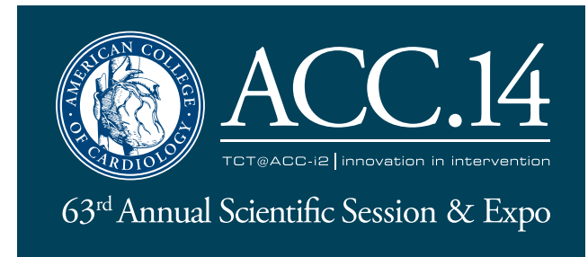
blue logo for dark backgrounds