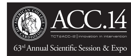
BW logo for dark backgrounds