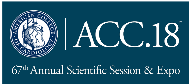
blue logo for dark backgrounds

The color configurations below should be respected at all times. When using colored papers, note that the ink color may not exactly match your color swatch because the paper color shows through in the offset printing process. Make sure the appropriate ACC.18 logo is used for light and dark backgrounds. Blue and black and white (BW) logos are available in horizontal and stacked lockups with complete and complete no date configurations.