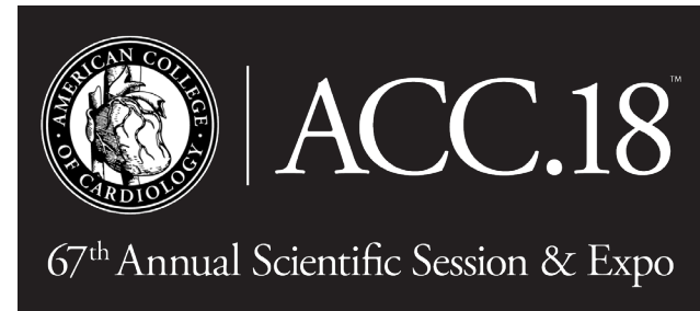
BW logo for dark backgrounds