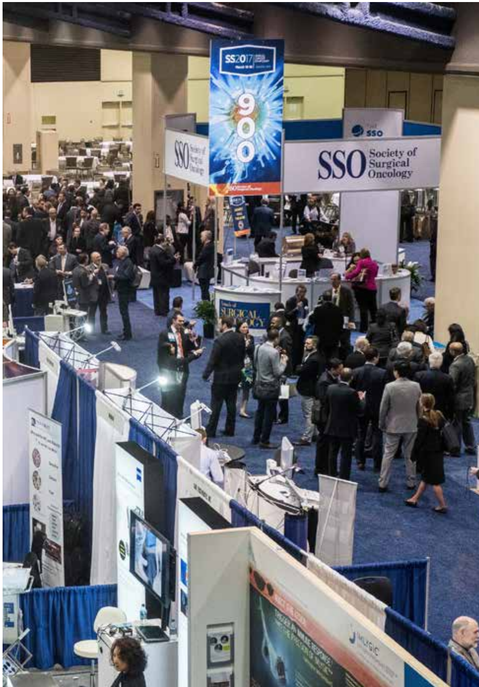
EXHIBIT HALL AND CONVENTION CENTER OPPORTUNITIES