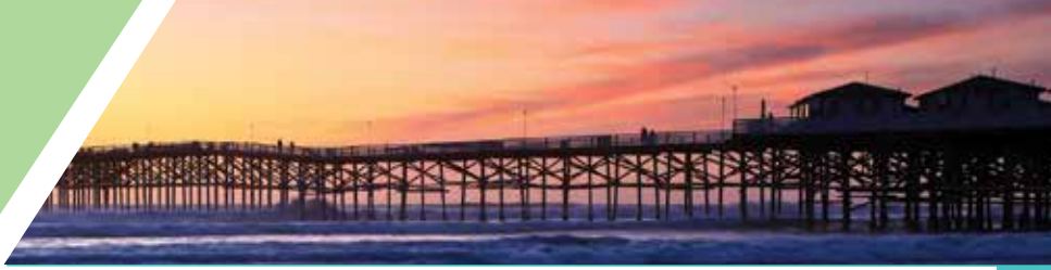
EXHIBIT AND SPONSORSHIP PROSPECTUS