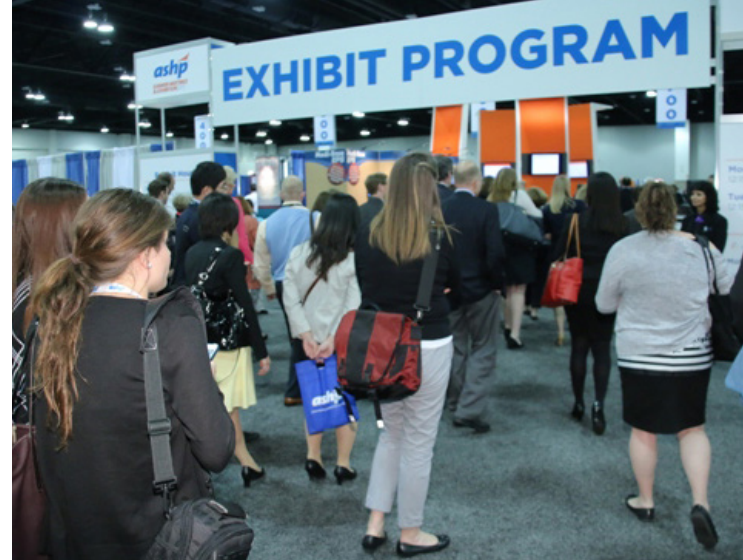
Exhibit Hall Hours

Saturday, June 2, 2018 8:00 a.m. – 5:00 p.m. Sunday, June 3, 2018 8:00 a.m. – 3:00 p.m.