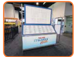
EXHIBIT HALL BANNERS

These free-standing signs are placed in high traffic areas in the the convention center. Your messaging is sure to be noticed with the large panels featuring your corporate or product advertising assisting attendees as they navigate around the convention center.